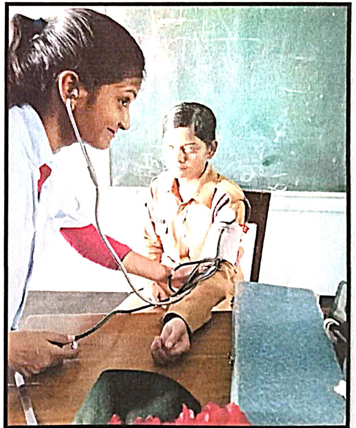
Fig: Different activities during survey Ncc girl